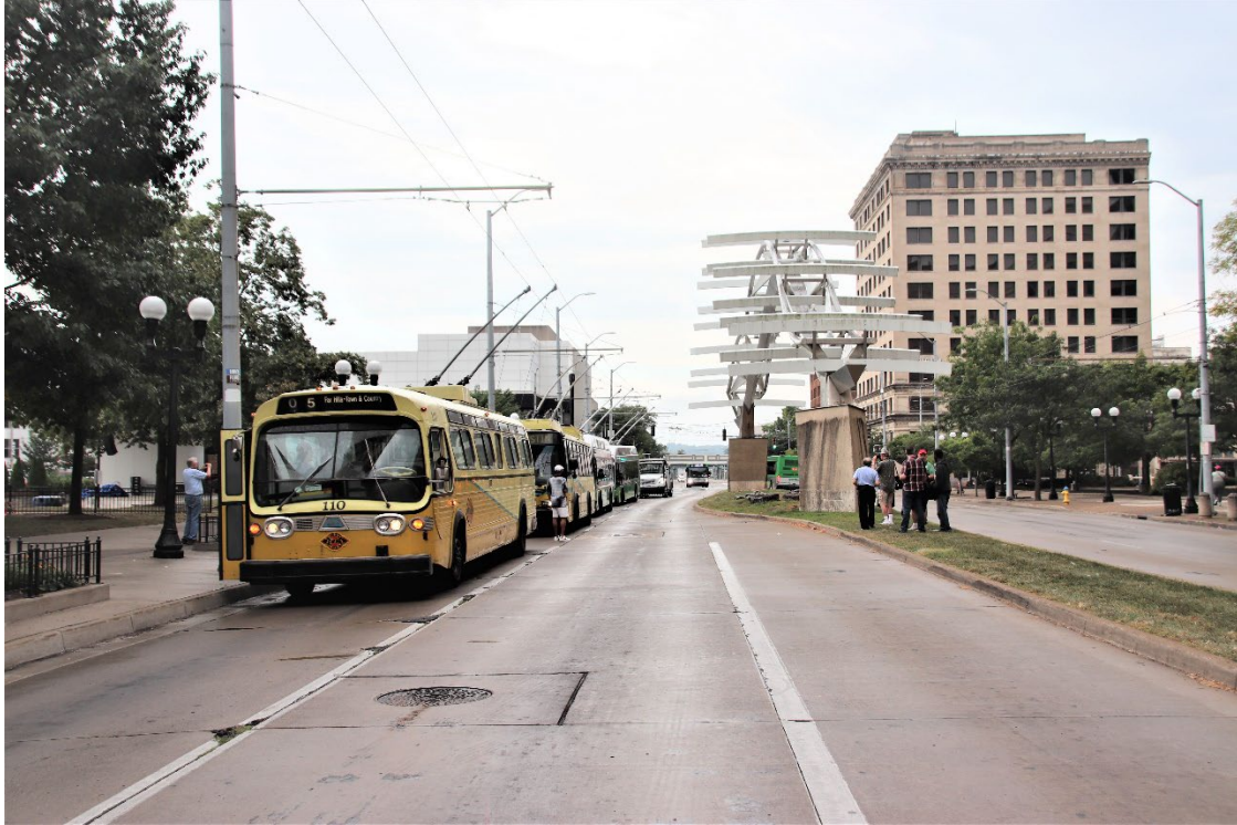
A photo line is forming in the medium next to the street art memorializing the first powered flight.