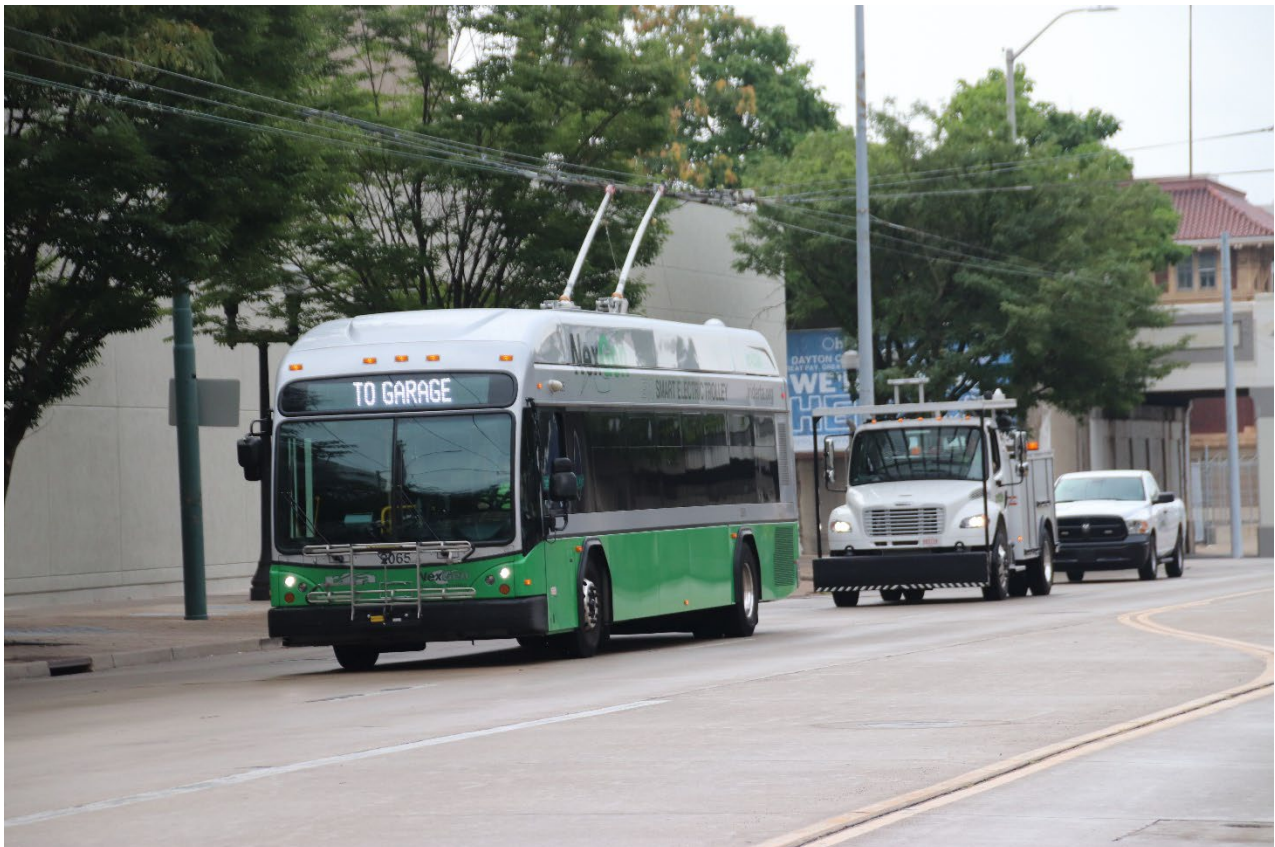
Bus 2065, a combination overhead wire powered and off wire battery powered trolley bus, being followed by the Dayton RTA push truck

Hopefully on the third Sunday in August 2023 Dayton RTA will treat the attendees of the Hoosier Traction Meet and the North American Transit Historical Society Convention to a day of seeing Dayton by riding a trolley bus.