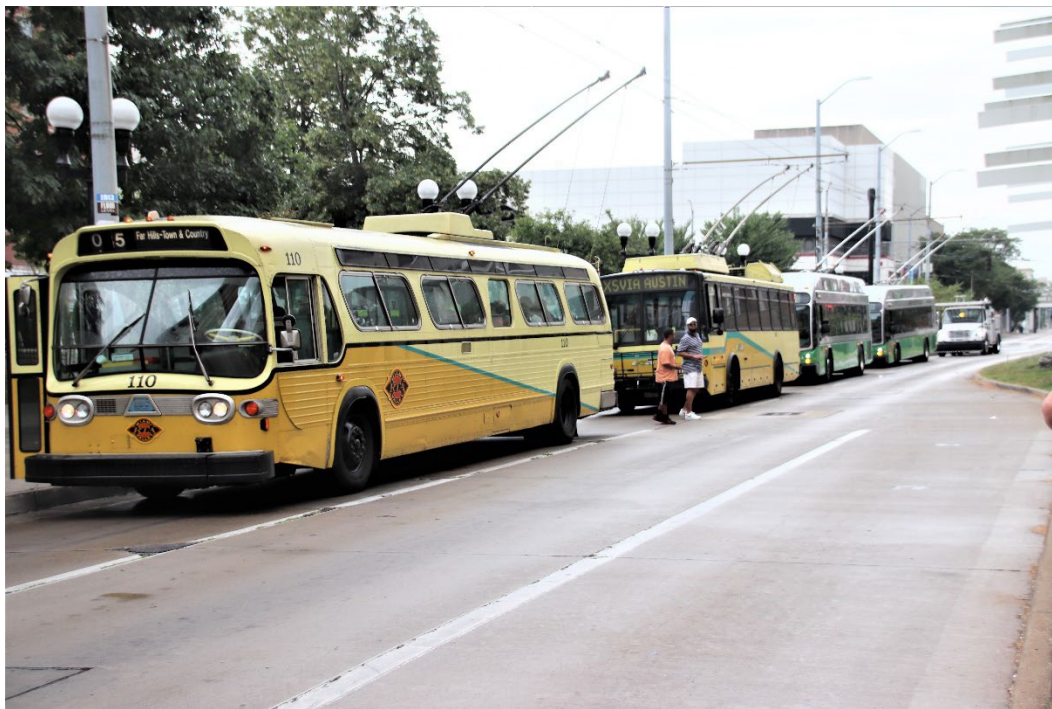
Our four buses pause curbside waiting for their riders to board.