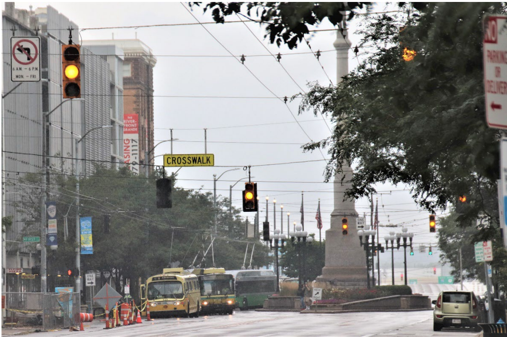
Our fleet of buses rounding Dayton's Civil War Monument.