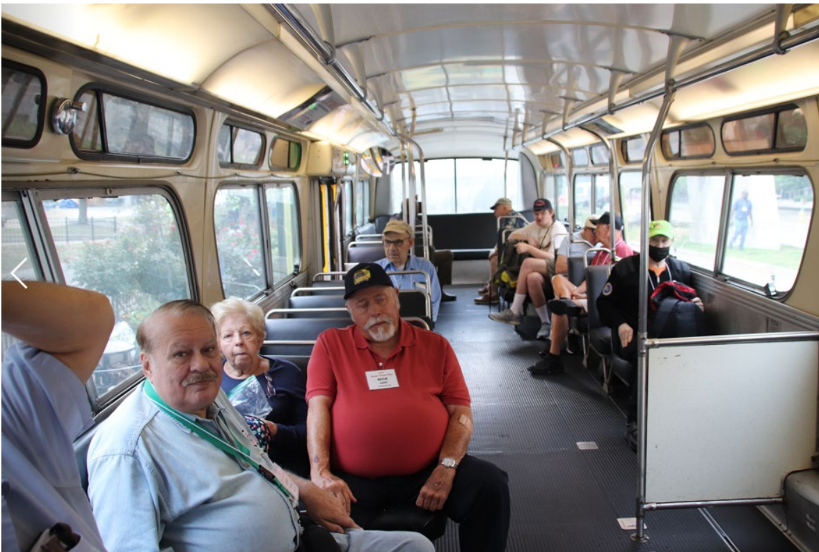
Convention attendees have claimed their seats on bus 9835.