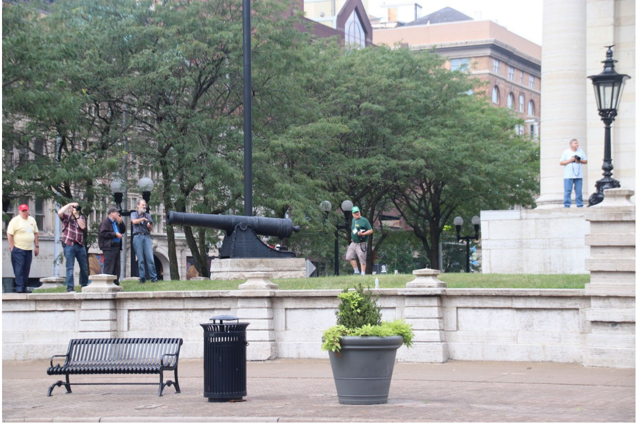
An impromptu photo line.