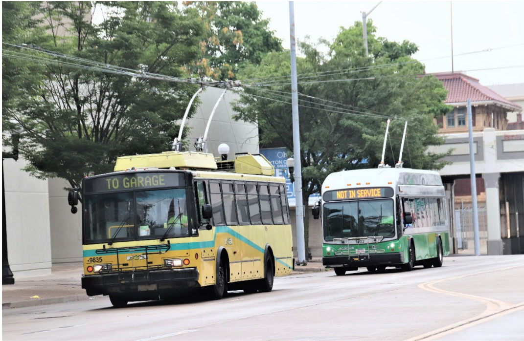
Dayton RTA trolley bus 9835 and trolley bus 1402 are seen having passed under the CSXT mainline.