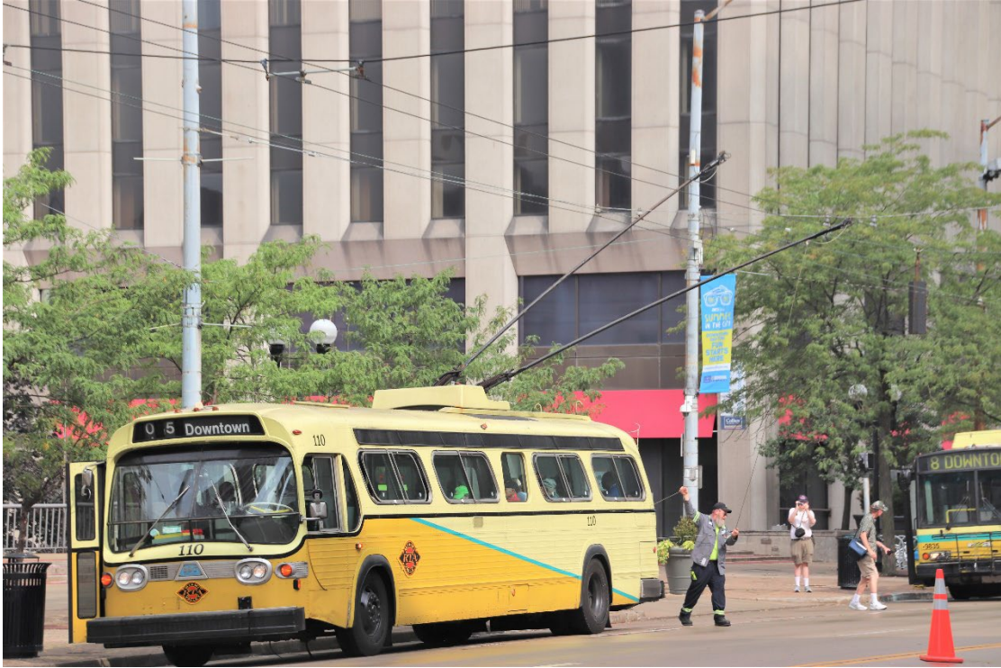
Trolley bus poles at times have a mind of their own.