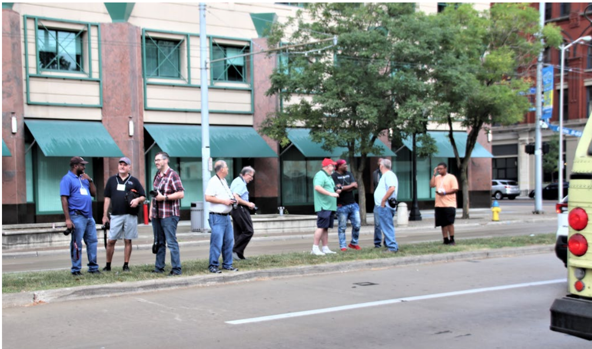
Two passerbys join the formal photo line.